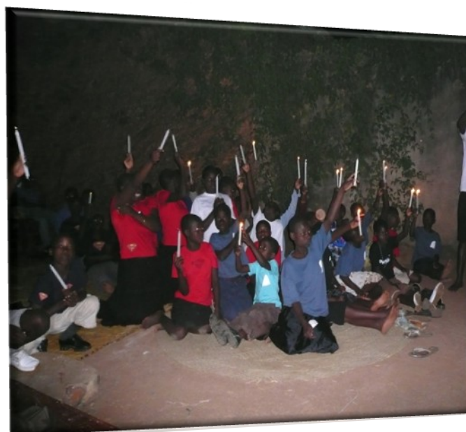
"It is better to light a candle than to curse the night" (Peter Benenson, 1961)

Tikondane Care for Children in/off the Streets (hereafter referred to as TCCS) is a Faith Based Organization (FBO) whose unique contribution is the "hands-on" care and protection of abused, neglected, vulnerable and marginalized children. The project was initiated by the Missionary Sisters of Our Lady of Africa (MSOLA) in the 1990's in collaboration with the Diocese of Lilongwe and will this year clock 14 years of service to the children on the streets.